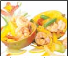
Spicy Mango Shrimp