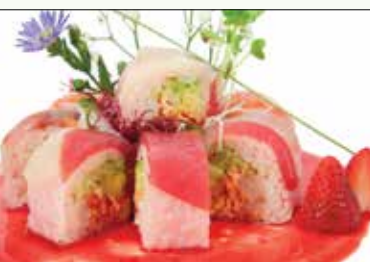
Ocean King Roll