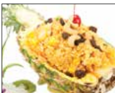
Hawaiian Pineapple Fried Rice