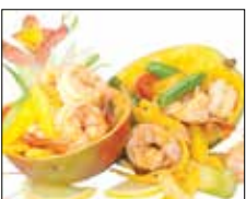
Spicy Mango Shrimp