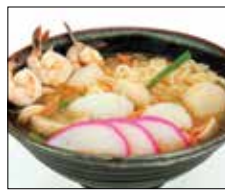
Malaysian Spicy Seafood Noodle Soup