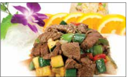
Filet Mignon Hibachi