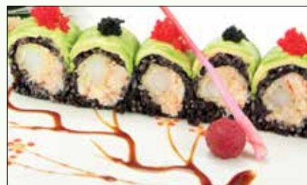
Black Angel Roll