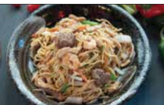
House Special Lo Mein