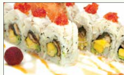
Blue Crab Fantastic Roll