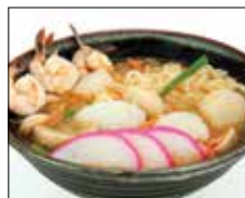
Malaysian Spicy Seafood Noodle Soup

Deep fried chicken/pork cooked w. egg, vegetable over rice