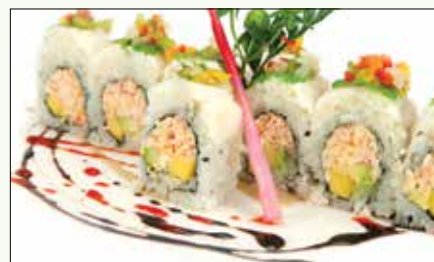
Chilean Seabass Special Roll