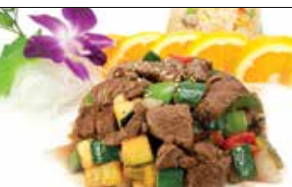
Filet Mignon Hibachi