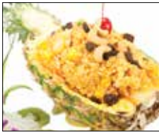
Hawaiian Pineapple Fried Rice